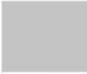
PANTONE 14-4201 TCX Lunar Rock