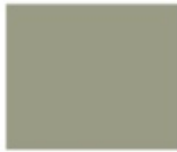
PANTONE 16-0213 TCX Tea