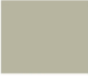
PANTONE 14-6308 TCX Alfalfa