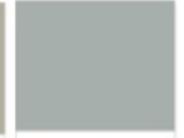
PANTONE 15-4702 TCX Puritan Gray