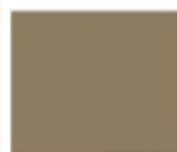
PANTONE 17-1019 TCX Elmwood