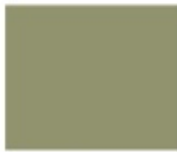
PANTONE 16-0421 TCX Sage