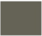
PANTONE 18-0515 TCX Dusty Olive