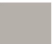
PANTONE 15-0000 TPG Dove