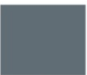
PANTONE 18-4214 TPG Stormy Weather