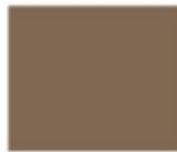
PANTONE 18-1014 TCX Malt Ball