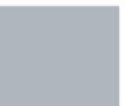
PANTONE 14-4206 TCX Pearl Blue