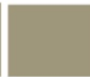
PANTONE 16-0713 TCX Slate Green