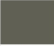
PANTONE 18-0517 TCX Tea Leaf