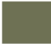
PANTONE 18-0422 TCX Loden Green