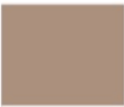
PANTONE 16-1310 TCX Natural