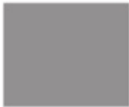
PANTONE 16-5101 TCX Wet Weather