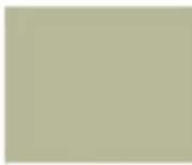
PANTONE 14-0216 TCX Lint