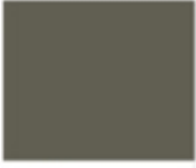
PANTONE 19-0512 TPG Ivy Green