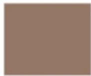
PANTONE 17-1321 TCX Woodsmoke