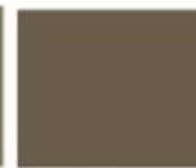
PANTONE 18-0820 TCX Capers