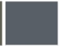
PANTONE 19-4215 TPG Turbulence