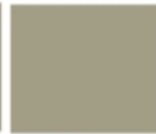
PANTONE 16-0613 TCX Elm