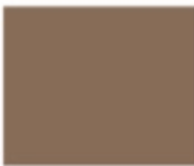
PANTONE 18-1020 TCX Cocoa Crème