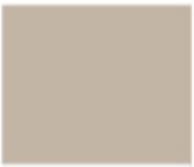
PANTONE 14-0708 TCX Cement