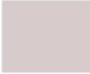
PANTONE 13-3803 TCX Lilac Ash

Choose 1 SIDING color from the left column and 1 ACCENT color that is opposite on the color wheel)