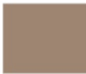
PANTONE 17-1319 TCX Amphora