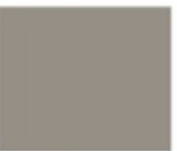
PANTONE 17-1210 TPG Moon Rock