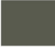
PANTONE 19-0511 TPG Grape Leaf