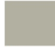
PANTONE 15-6307 TCX Agate Gray