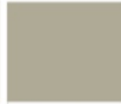
PANTONE 15-6410 TCX Moss Gray