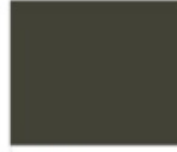
PANTONE 19-0414 TCX Forest Night