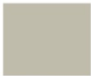
PANTONE 14-6305 TCX Pelican