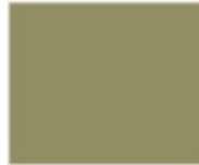
PANTONE 16-0526 TCX Cedar