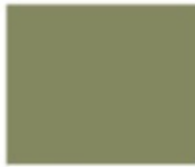
PANTONE 17-0525 TCX Mosstone