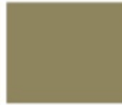
PANTONE 17-0625 TCX Boa