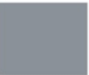
PANTONE 15-4304 TCX Weathervane