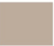
PANTONE 15-1308 TCX Doeskin