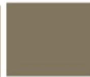
PANTONE 18-0617 TCX Covert Green