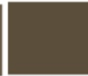
PANTONE 19-0618 TCX Beech