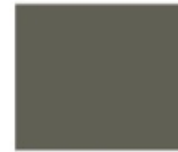
PANTONE 18-0517 TCX Tea Leaf