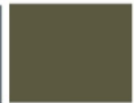
PANTONE 18-0523 TCX Winter Moss