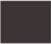
PANTONE 19-1101 TCX After Dark